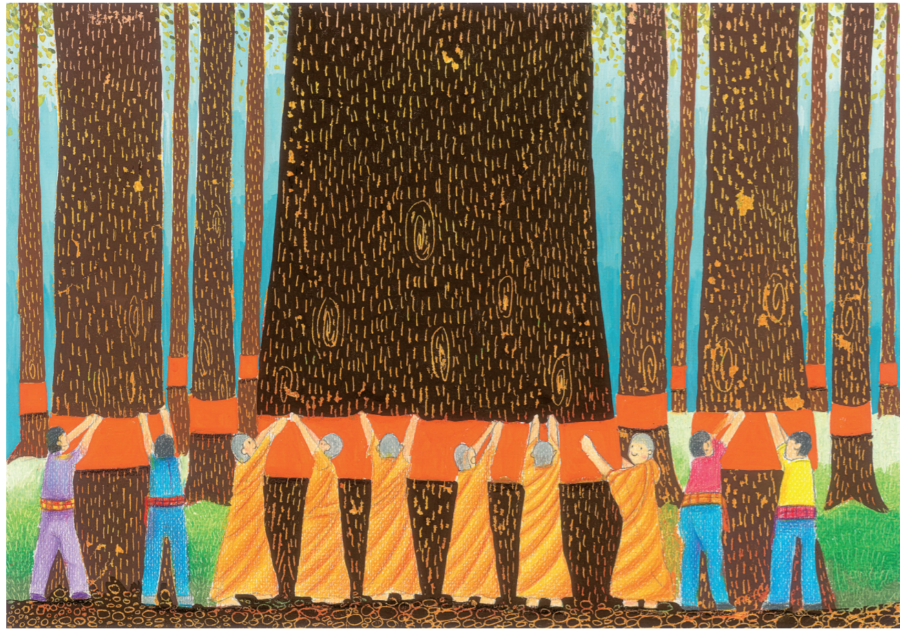
“eco together” - Planet Earth Grand Prix: “Buuat Pa” - The Buddhist ritual to conserve forest Kodchapan Malisorn (14)