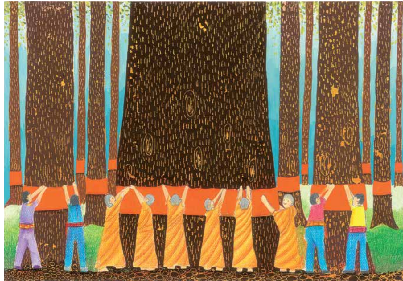
"eco together" - Planet Earth Grand Prix: "Buuat Pa" - The Buddhist ritual to conserve forest Kodchapan Malisorn (14)