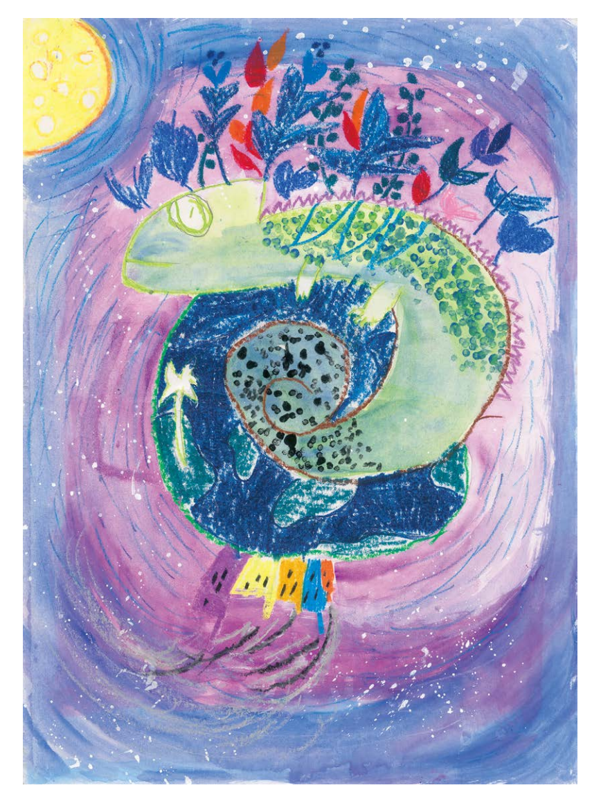
Winner of the 11th Kao International Environment Painting Contest for Children "eco together" - Planet Earth Grand Prix "The Color of Future" Liang-En Yu (8 years old )

KAO International Environment Painting Contest for Children