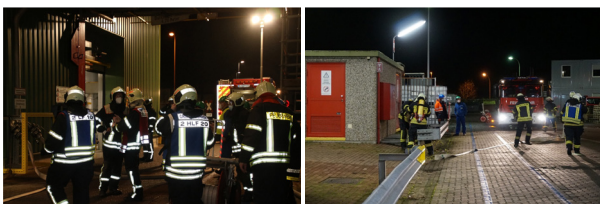
Nighttime emergency drill at Kao Chemicals Germany

Every year on Disaster Prevention and Volunteers Day, a disaster prevention message is posted to all employees in Japan to enhance their disaster awareness. In addition, days when accidents occurred are designated as Safety Days, to help ensure that the efficacy of past drills is not weakened by the passage of time. Moreover, the Kao Group Disaster Prevention Manual is distributed annually to all employees in Japan.