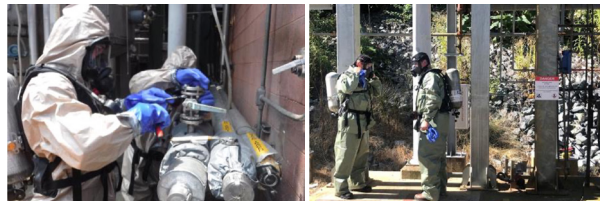
Chemical leakage drill at Kao Specialties Americas LLC

Our audits of safety, maintenance and other technologies, which are aimed at maintaining and enhancing our global safety level, were conducted remotely due to restrictions on movement imposed by COVID-19.