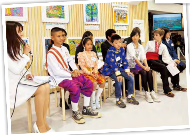
Interview session with all the top award winners