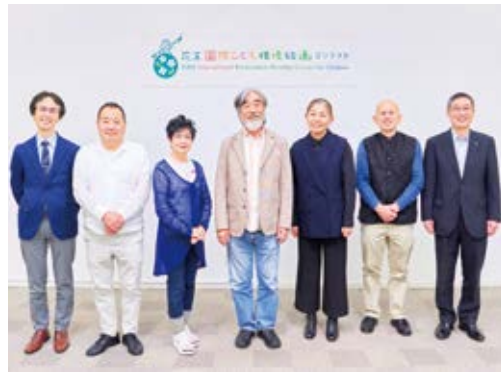
The final screening held on October 11th