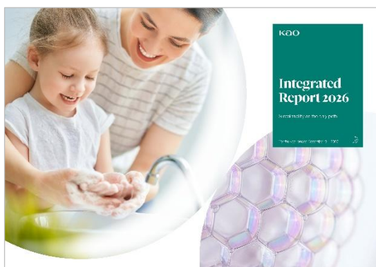
Kao Integrated Report 2026

Toward the achievement of its Mid-term Plan “K27” and beyond, Kao is advancing its Global Sharp Top strategy, with the aim of becoming a unique presence that is indispensable to someone in the world. Through the two reports released today, Kao presents its medium- to long-term value creation story and progress under its ESG strategy, the Kirei Lifestyle Plan, showing how the company is pursuing sustainable growth and contributing to society.