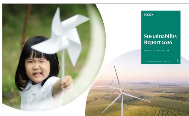
Kao Sustainability Report 2026