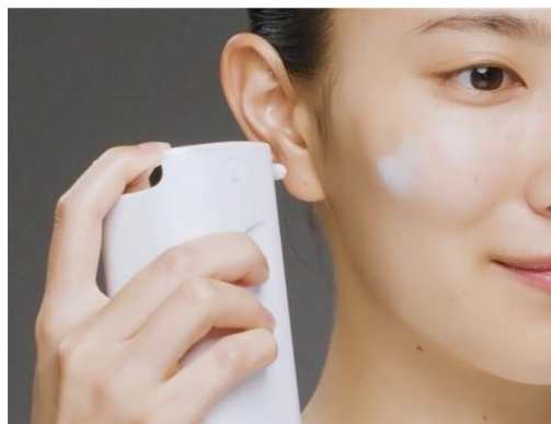
Application of the veil with a diffusing device

Kao has collaborated with Panasonic Corporation to develop an advanced version of the Veil Creator diffuser. Once loaded with Curél Outfit-for-Skin Potion in a dedicated cartridge, the new Veil Creator Diffuser can apply an ultra-thin veil on a targeted area in a matter of seconds. The device is compact and freestanding, for easy handling.