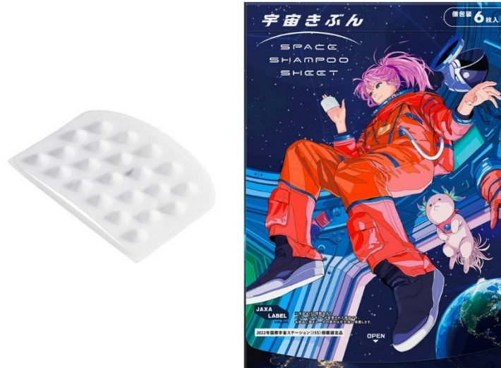
Space Shampoo Sheet : the product and package

Japan's veteran astronaut Koichi Wakata lived on the International Space Station (ISS) on a five-month mission from October 6, 2022 to March 12, 2023, setting the space duration record for an astronaut from Japan. His bags were packed with a supply of 3D Space Shampoo Sheets, a dry type of shampoo developed by Kao Corporation. The same sheet, now available commercially under the brand name Space Shampoo Sheet , can easily wipe impurities from the scalp and hair without water. A light massage of the contoured sheet over the hair removes excess sebum and refreshes the scalp. The sheets can be used indoors or outdoors, whenever a user wants to wipe away perspiration and stickiness without a shower or bath.