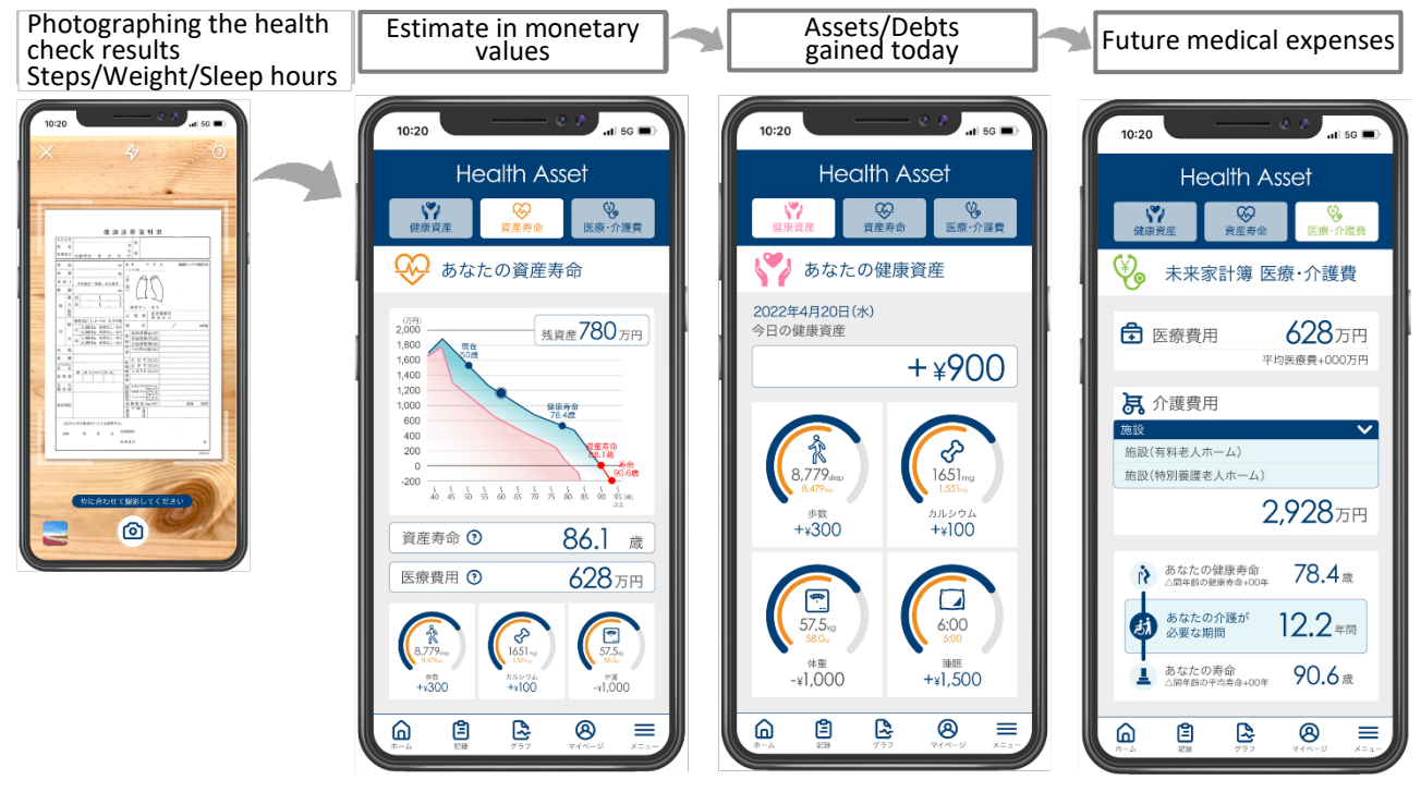
Screen images of AI Health Visualization Tool