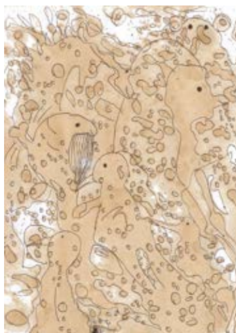
Our little Brothers - impression

The black border around the picture makes it feel like the opening scene of a movie and attracts the viewer's attention. The black-and-white areas, such as the moon and birds, as well as the colored flowers, are also interesting to look at. It makes us think that the work looks different depending on the angle from which we look at it.