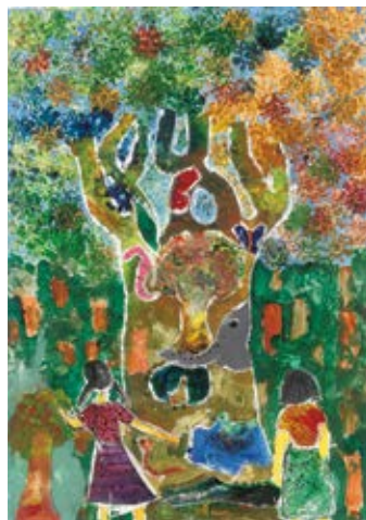
I LOVE MY ENVIRONMENT

The artist straightforwardly expresses the reduction of plastic, saying that vegetables and fish are blessings of nature, so they should be packaged in natural materials rather than plastic. Each food is drawn with looking tasty, and the work as a whole has a very strong touch.