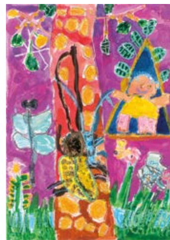
Friends gathering around a tree with sweet sap

It is a very enigmatic work, but if you look at it carefully, you will see only eyes in various organisms. The fact that the artist describes unidentifiable creatures as their "brothers" is very interesting, and the work is both philosophical and fascinating.