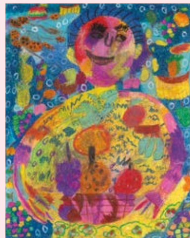
Let's make a sustainable harvest in my garden