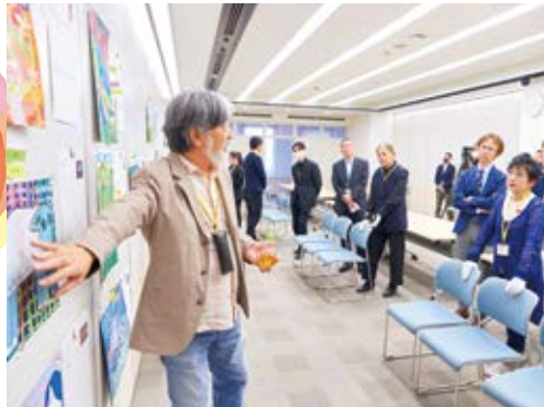
The final screening held on October 11th