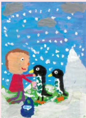
Cleaning up the penguins