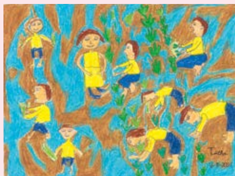
STUDY WITH FIELD TRIP