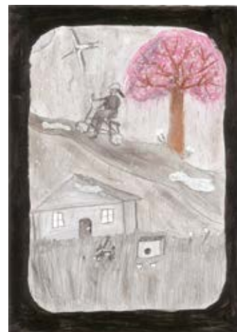
My Modern, Industrial city - impression

A magical tree is depicted by the artist's imagination, but it is as lifelike as if it were real. The more we look at the work, the more we appreciate, with the white outlines and the spongy coloring of the leaves.