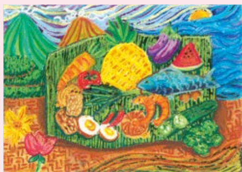
HARVEST FROM NATURE WITHOUT PLASTIC