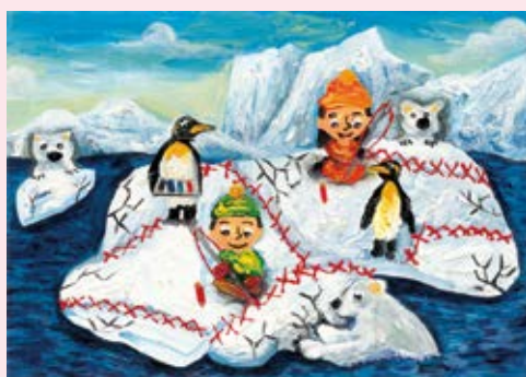
Rebuild The Ice