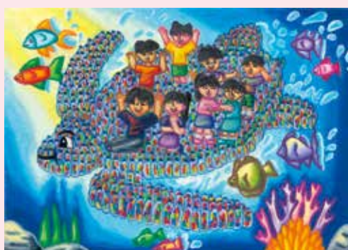
LET'S SAVE OUR ENVIRONMENT