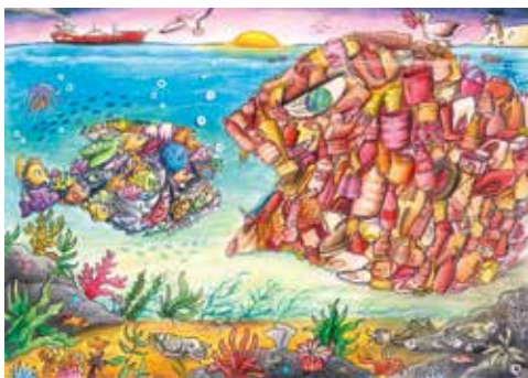
SAVE OUR OCEAN, SAVE OUR FUTURE!

Air and water are vital for plants and nature. This preciousness is expressed well with the water in the center and the rainbow upside. The scene around the water looks joyful, and we feel hopes.