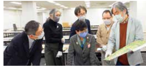
The final selection screening held on December 9th