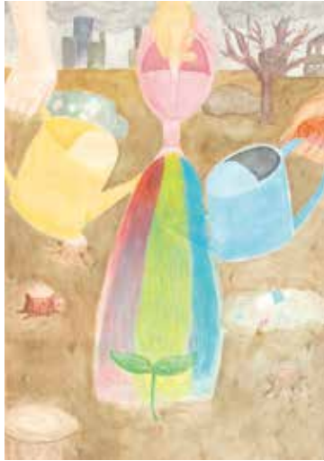
A New Shoot

The painter observes with own viewpoint and digests the scenery as own story. It depends on each one to take what the story tells. The work is inspiring and exciting.