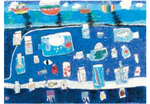
The rubbish is home.

The painter is zooming in on a tiny event which is a plant sprouting. The hopeful moment of the seed coming into life is quietly presented in light colors. The painting awakens us to the fact that the world could be viewed from such a humble perspective.