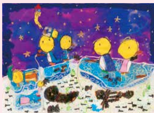
Penguins Looking for Fish to Eat