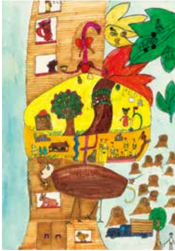
A Tree House That is Kind to the Environment