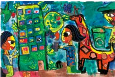
Let's make our environment Sustainable, together

The plastic waste issue is turned into a beautiful design, but the painting shows that the painter as a child clearly sees it as an issue. The use of red as an accent color to bring out the large blue part shows wonderful artistic sense.