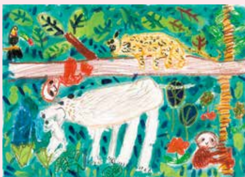
A Beautiful Forest