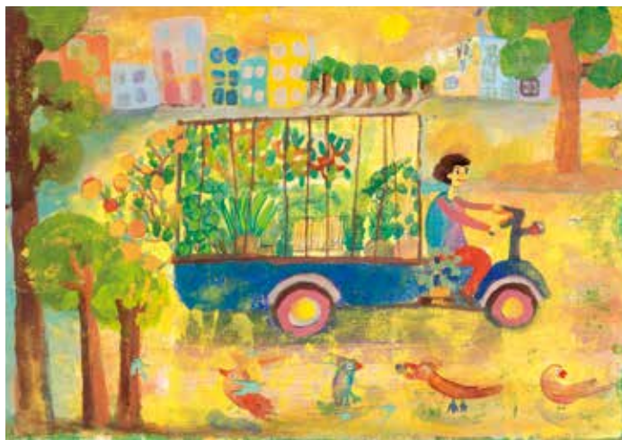
Angel of Nature

There is a moment just before sunset when the landscape is enveloped in a golden shine. The painting reminds us that there are beautiful moment and happiness in our ordinary life, which we are common to forget as we keep busy. The painting warms our heart as beautiful nature and the scene we stare at and it makes us wish that the happy scene in this painting will last forever. The sensitivity is outstanding, catching and cherishing this moment, and wanting to draw it as well as the power of expressions that makes us viewers to feel the birds chirping, the car revving, and even a whiff of the air in town.