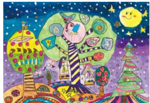
THE BIG TREE AND ME

The painting has a unique expression that a lump of waste is going to eat fishes. It describes the situation very well that marine debris keep increasing and fishes are facing a risk. The painting is drawn to every detail.