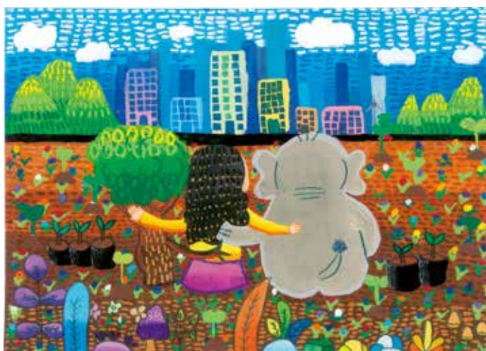
I love forest. I love animals. I love earth.